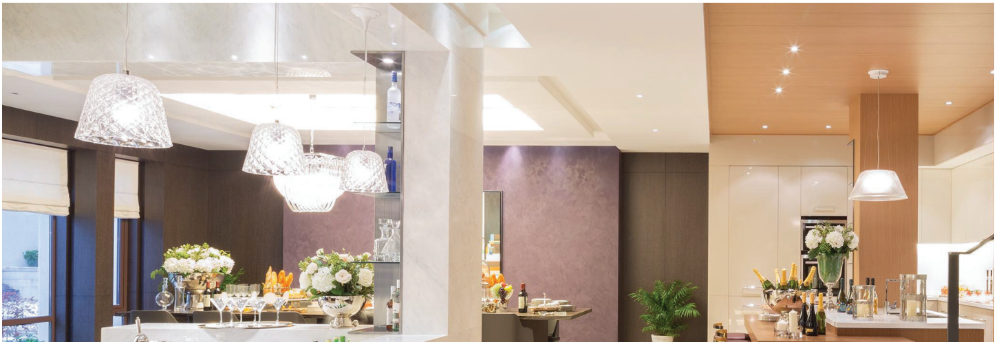
LED LIGHTBULB A19