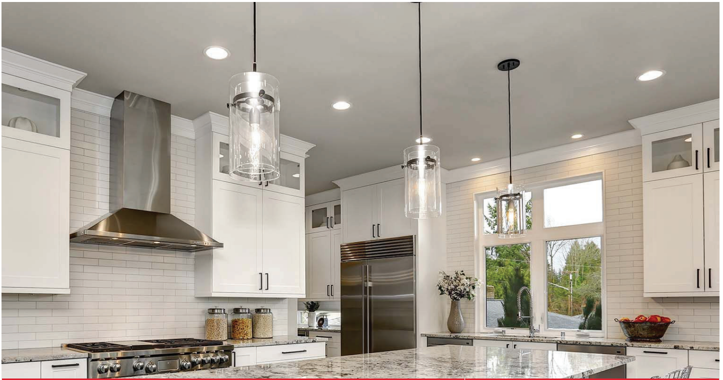
LED FILAMENT LIGHT BULB