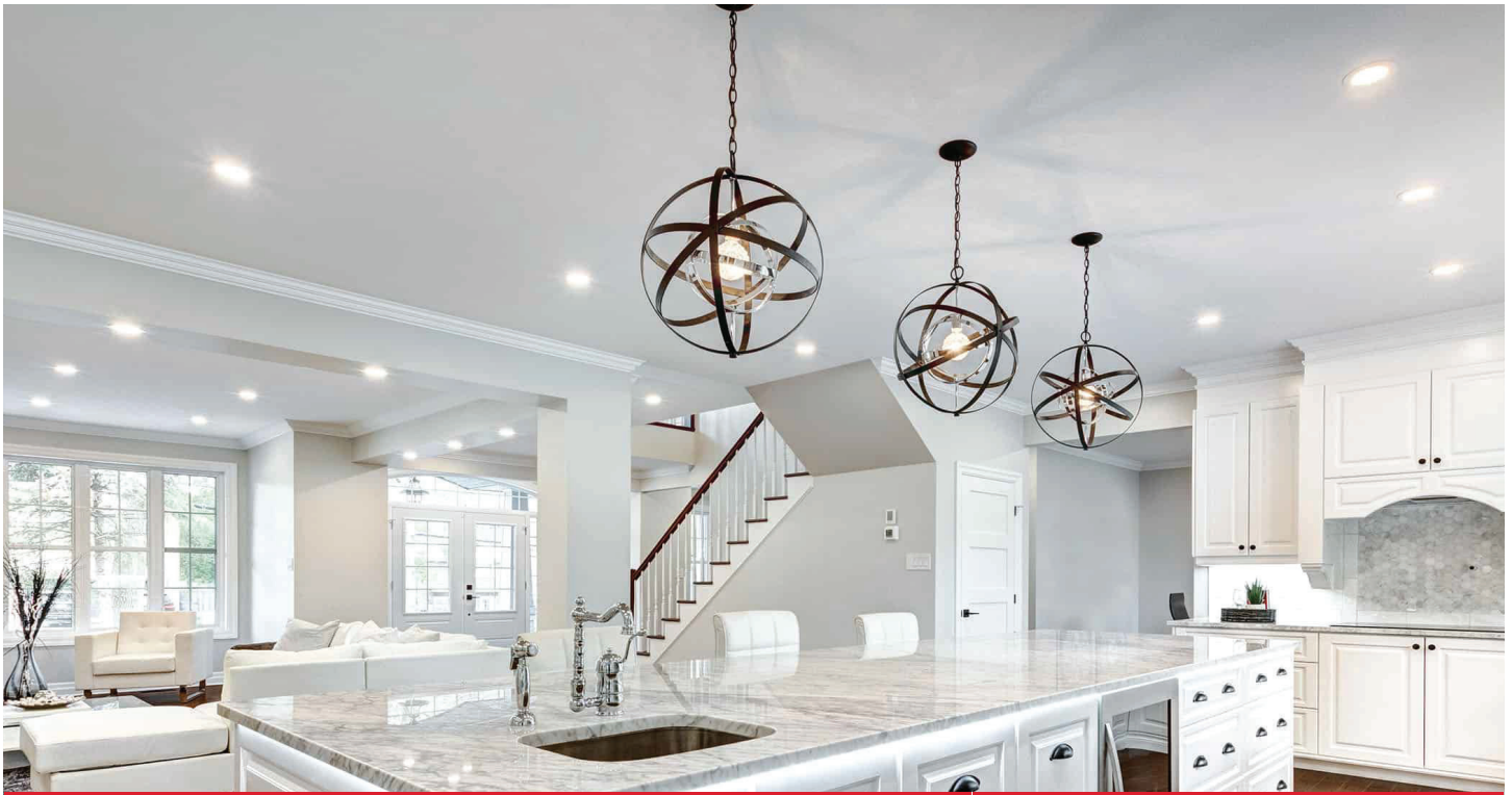
LED FILAMENT LIGHT BULB