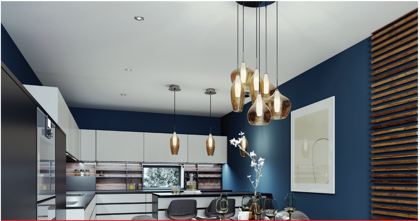
LED MINI-BULB G9