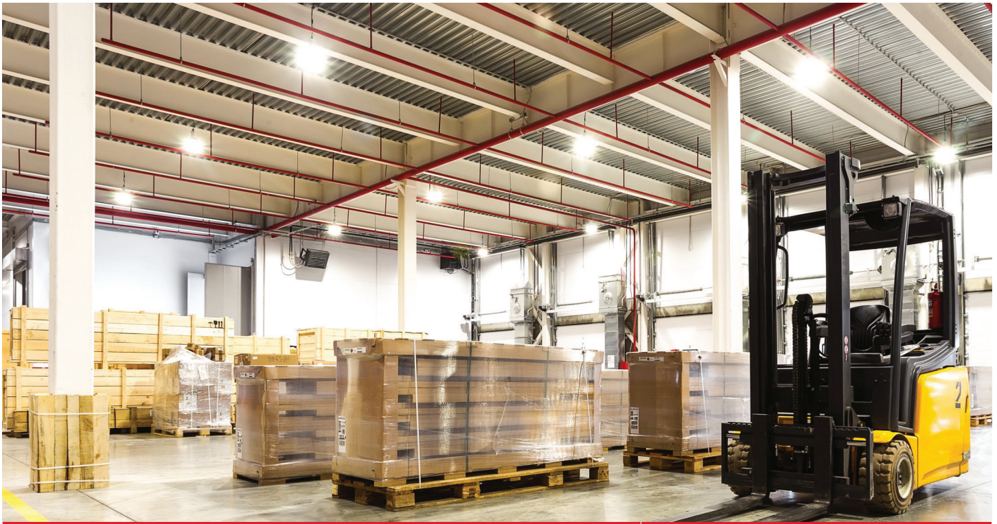
LED Highbay Lightbulb