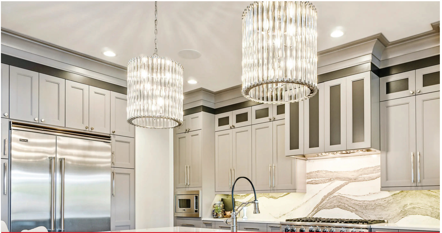
LED FILAMENT LIGHT BULB