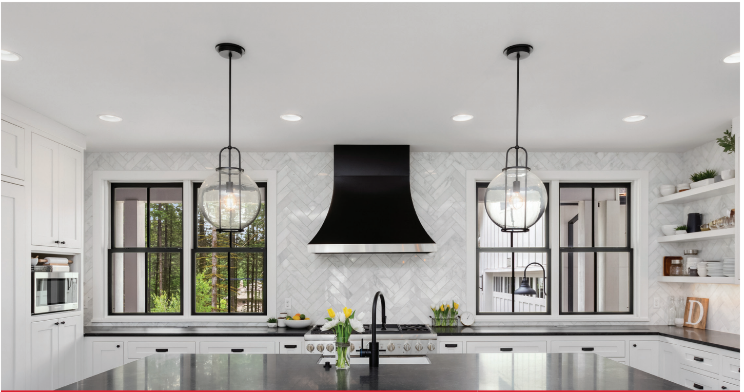
LED FILAMENT LIGHT BULB