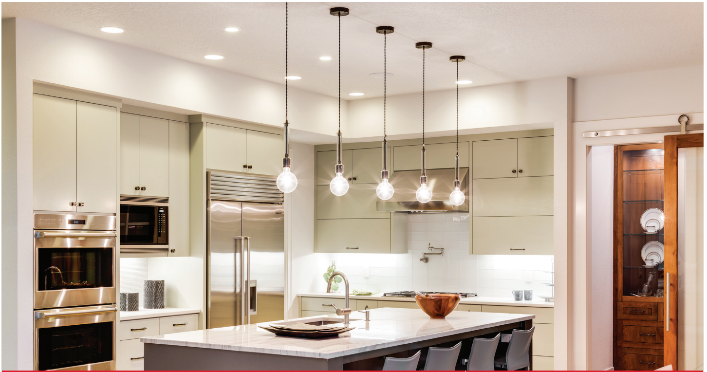
LED RECESSED SPOTLIGHT