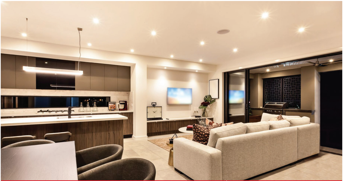
LED RECESSED SPOTLIGHT