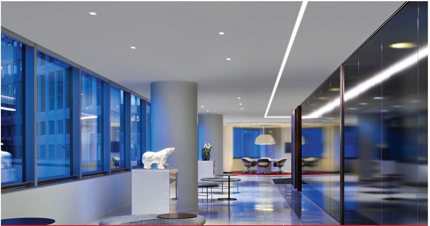
LED RECESSED SPOTLIGHT