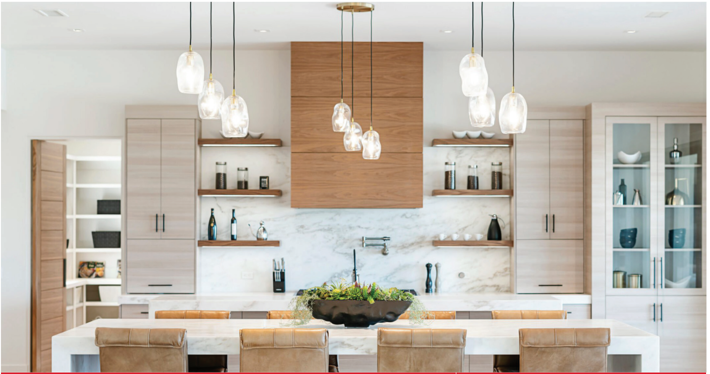
LED MINI-BULB G4