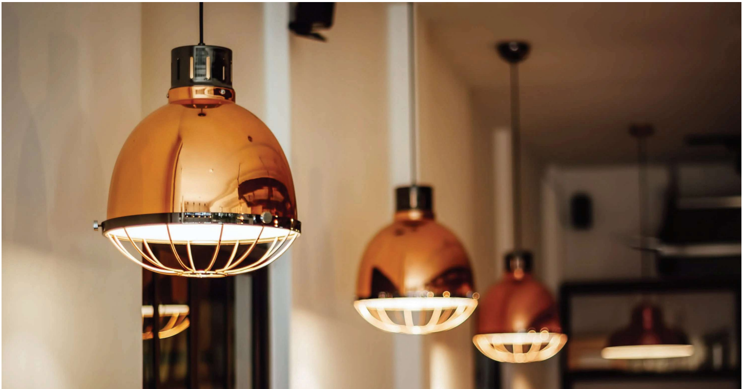
LED FILAMENT LIGHT BULB