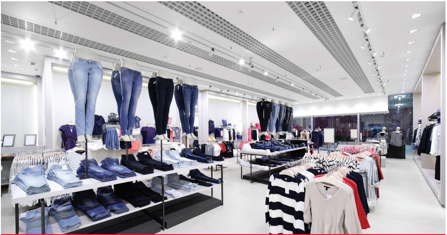
LED LIGHT BULB