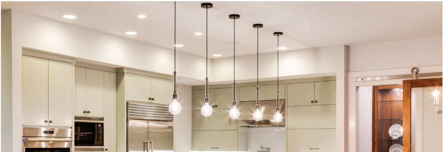
LED RECESSED PANEL LIGHT