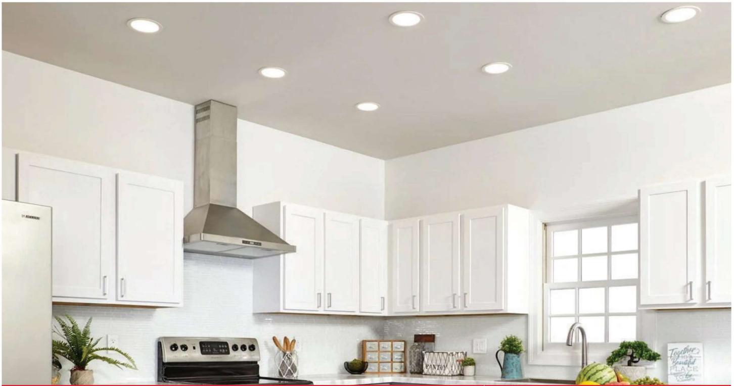
RECESSED LED PANEL LIGHT