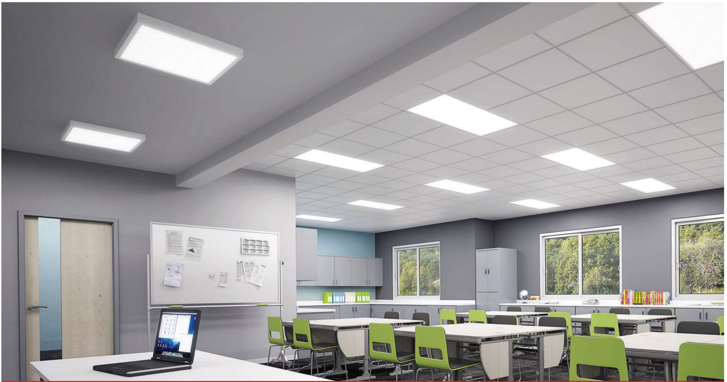
SURFACE MOUNTED LED PANEL