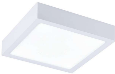
(CCT) Color Temperature Switch