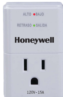
Voltage protector-15A HW-SP-03