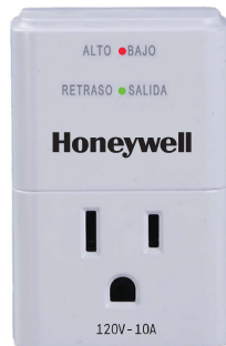
Voltage protector-10A HW-SP-02

A/C up to 12,000BTU (10Amp) A/C up to 18,000BTU (15Amp)