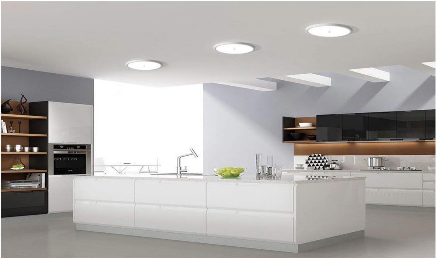
SURFACE MOUNTED LED PANEL