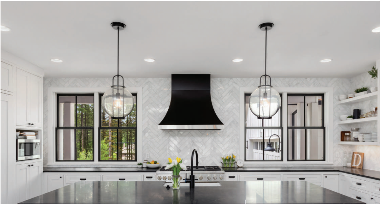
LED FILAMENT LIGHT BULB