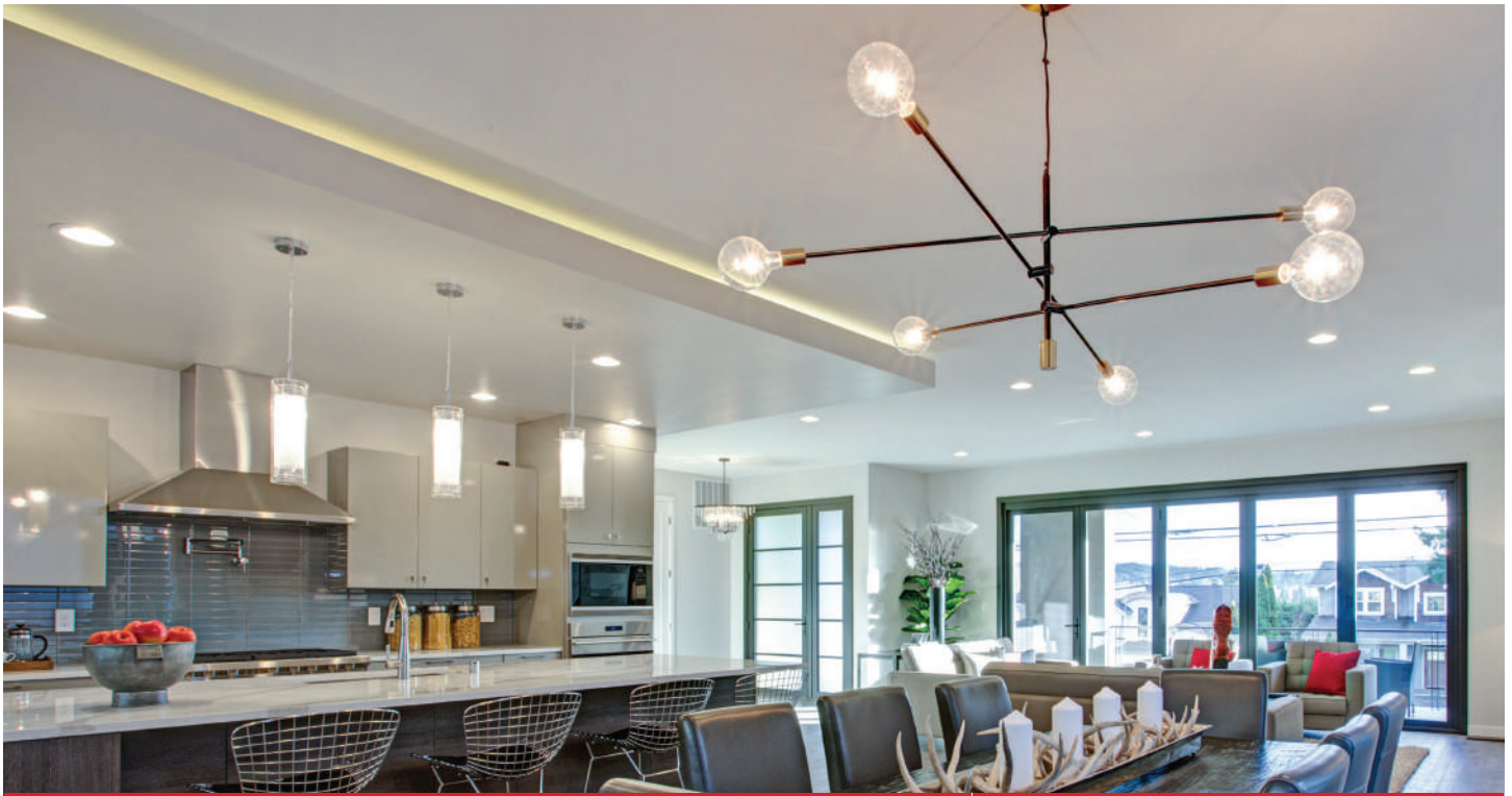
LED FILAMENT LIGHT BULB