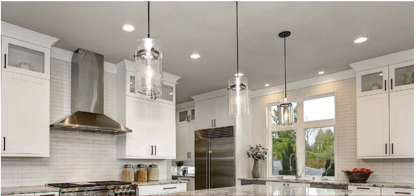
LED FILAMENT LIGHT BULB