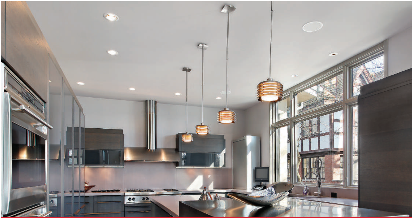
LED MINI-BULB G9