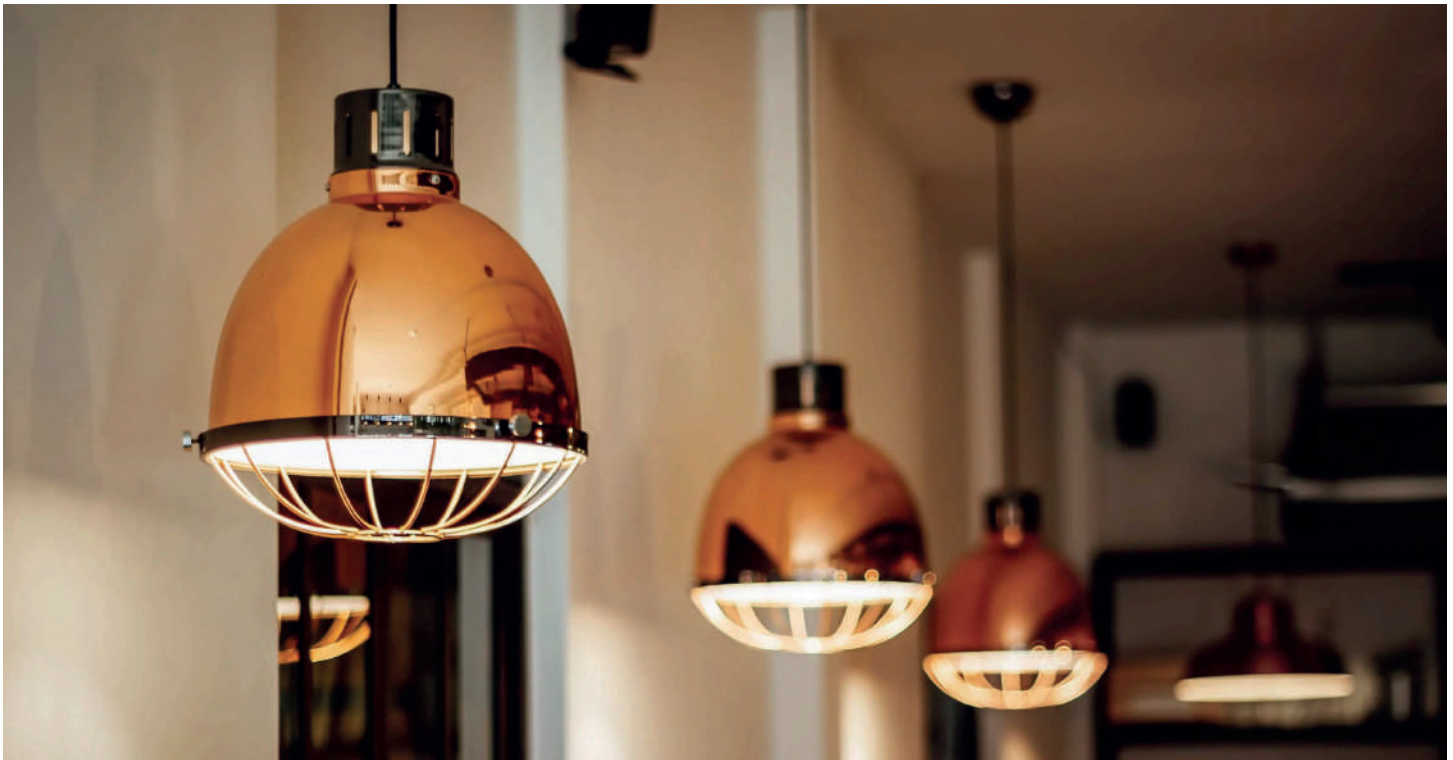
LED FILAMENT LIGHT BULB